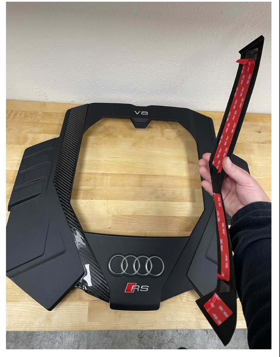
Step 5 Repeat this process for the other side.