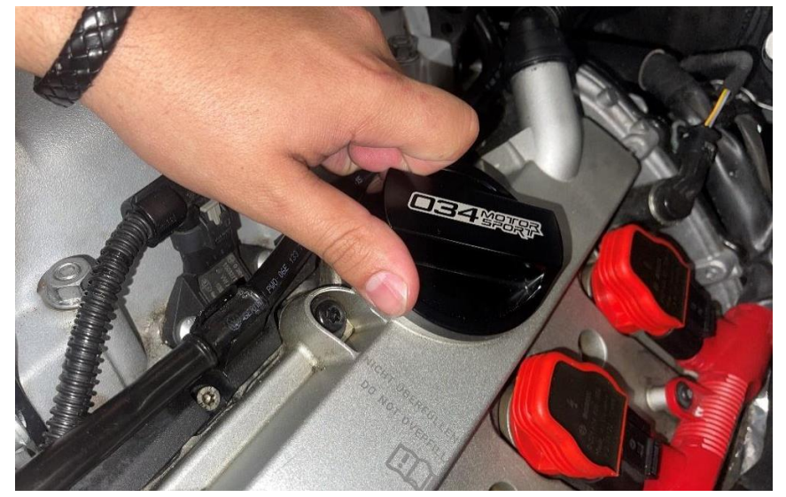
Step 4 You are done. Tough one, right? Enjoy!