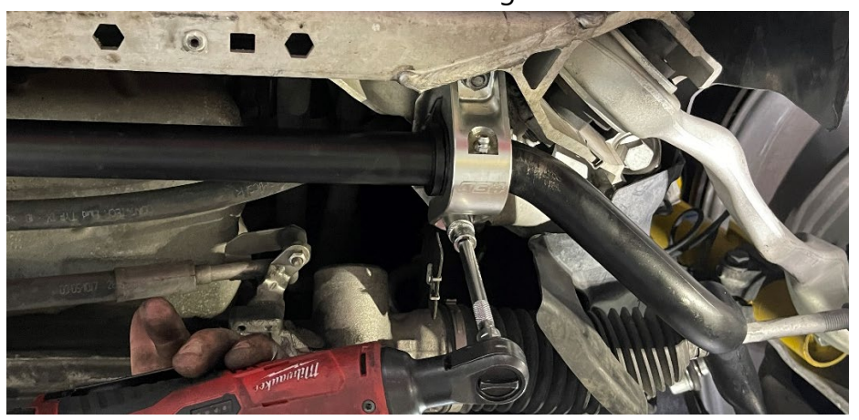
Step 11 Torque the sway bar bracket hardware to 21Nm.

Grease and install supplied 034Motorsport sway bar bushings to the sway bar, then use a 13mm socket to secure the sway bar with the billet mounting brackets.