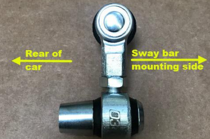
View of left side end link, from middle of car, looking outward