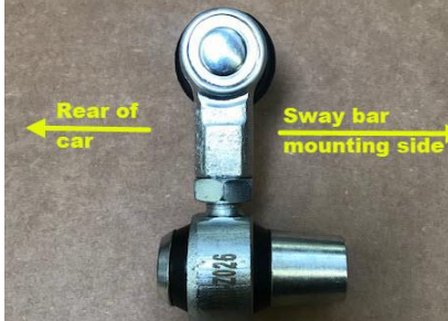
View of left side end link, from middle of car, looking outward