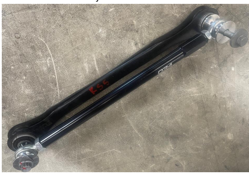
Step 6 Insert spacers into the bushings at the cylindrical end of the tube.

Use the length of the stock end link to set the initial length of the 034 adjustable front end links.