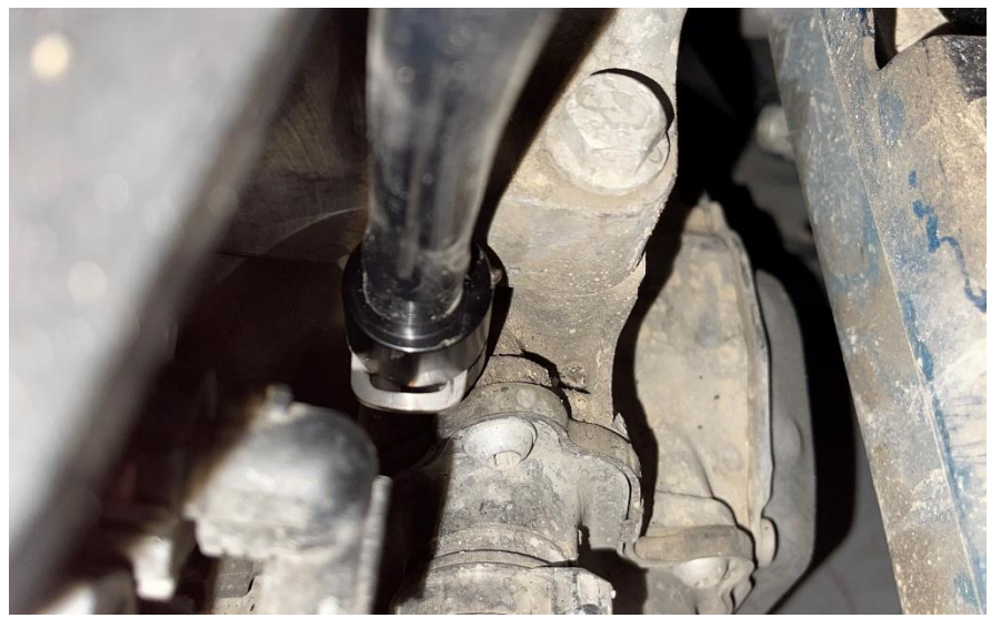
Step 10 Using a 7mm socket, tighten one of the hose clamps to secure the hose to the adapter.

Install the silicone hose over the adapter nipple.