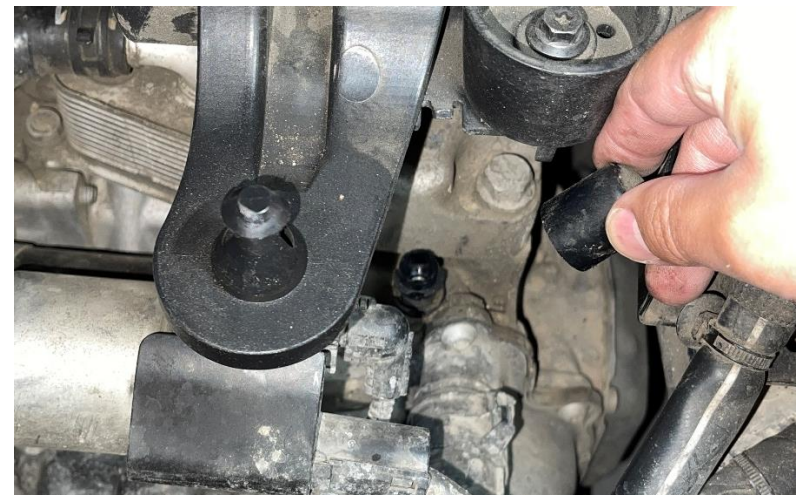
Step 6 Install the 034 transmission adapter into the vent tube.

Remove the stock transmission vent tube cap or install the tube from the transmission cover assembly if you have a factory breather hose.